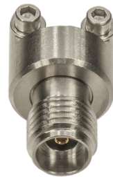
Common Interface ELF40