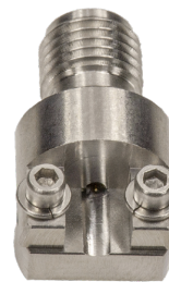
Narrow Profile ELF40-001