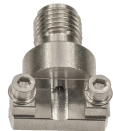
Standard Profile ELF40-002