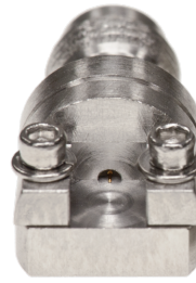
Narrow Profile ELF67-001