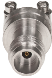
Common Interface ELF67