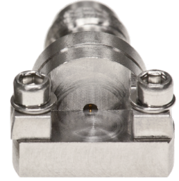
Standard Profile ELF67-002