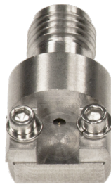
Common Interface ELF40