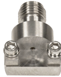
Narrow Profile ELF40-001