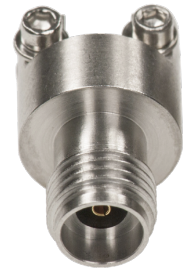
Standard Profile ELF40-002